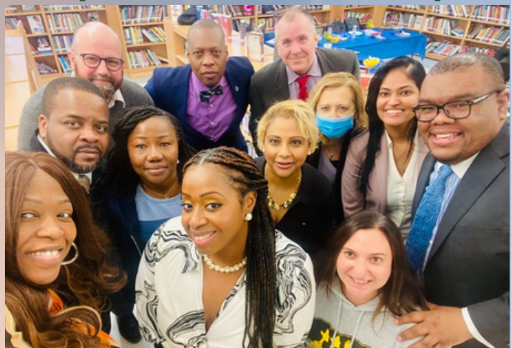
Our Newest & Brightest Principals